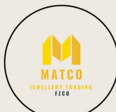
MATCO JEWELLERY TRADING FZ - LLC